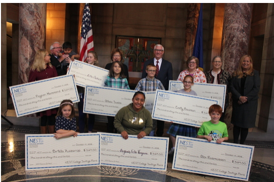
Eight of the 15 Read to Win winners with Treasurer Stenberg and representatives of First National Bank and the Nebraska Library Commission at a ceremony in the Capitol.

https://treasurer.nebraska.gov/csp/scholarships/read-to-win/2018/winners-recognized/