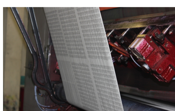
Forty pages of names - 30,865 to be exact - roll off the presses at the Lincoln Journal Star. A total of 253,000 tabloids will be distributed in Nebraska newspapers in March and April.