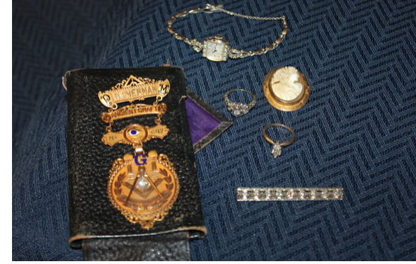
wristwatch, and a Masonic medal.

Among the auction items are pins, rings, a