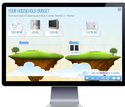
Classifying Needs vs. Wants

Good and Bad Money Decisions - Some decisions are easier to make than others. When it comes to money, how do you evaluate which decision is a good one? In this activity, students look at real-life budgetary decisions, and explore what the consequences might be.