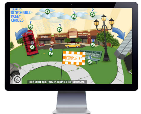
Navigating through the world of Vault