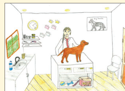
Brooke, sixth grade, Tilden, NE - one of 12 winners in 2016

Students in kindergarten through eighth grade can use their artistic skills to create landscape drawings of what they dream of becoming when they grow up. The Nebraska Art Teachers Association will select 12 winners (from the first 400 entries received) who will receive $1,000 each. Contest deadline is April 30, 2017.